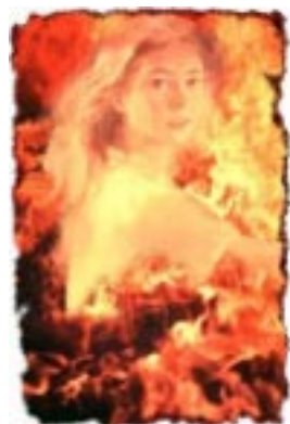
"Won't you come and join me?" I ask.

Here is an interesting anecdote. Someone said that Master is from Gongzhuling City. Several people from Changchun immediately said, "No, he is from our Changchun! He was born in Changchun, grew up in Changchun and lived in Changchun."