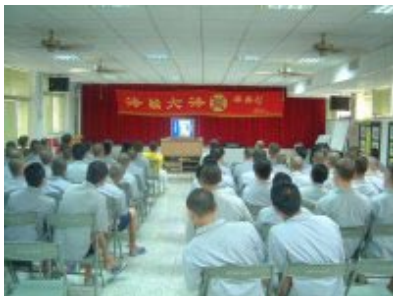
Prisoners watching Teacher's Fa lectures at Changhua Prison

A practitioner said: "When the prisoners first read Zhuan Falun with us, most of them did not even know what Falun Dafa was about. But on the third and fourth day, some of them already read through the entire book." After constantly reading the book and practicing the exercises, some prisoners asked where the practice sites are located in Taichong and Penghu, because they wanted to introduce Dafa to their relatives. They also expressed their wish to continue to practice Falun Gong after they complete their terms.