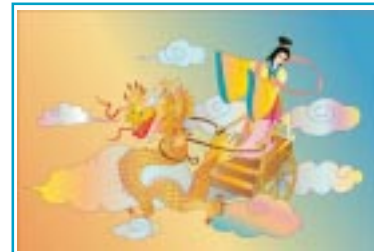
A thunder-chariot, drawn by a flying dragon, bore the Goddess up to the clouds and beyond

Dear little friends, the story is over. The legend of Goddess Nuwa mending the sky has continuously spread among the folk until now. Why is it so? Because human beings have good hearts and minds, they always want to tell others good things. God is merciful to us, that we broke layer upon layer of shackles in our hearts, and the compassion in our hearts was also expanding.