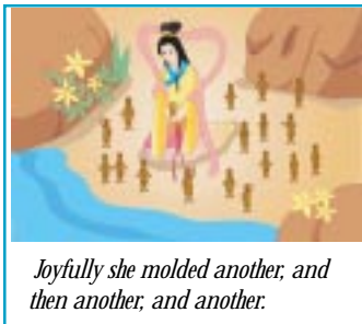
Joyfully she molded another, and then another, and another.

human beings lived in the wonderful world, creating wealth, working with their hands, and leading happy and peaceful lives.