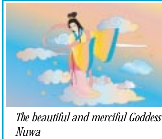
The beautiful and merciful Goddess Nuwa

One day, Nuwa came upon a broad field. She was so delighted by the world full of the chirping of birds and the fragrance of flowers that she didn't want to go back. She however had a nagging feeling that something was missing. The feeling stayed with her as she walked all the way to the water. She squatted down to drink. Seeing the beautiful image of herself in the mirror-like water gave her the idea of creating lives. Excitedly, she grasped a handful of mud, and molded a figurine, an imitation of herself. Strangely enough, when she put down the figurine, it immediately came to life! How magical! It even called her "Mama" and jumped up and down. Joyfully she molded another, and then another, and another. She worked so hard that her fingers grew sore. But still, the figurines she molded were too few; how could they fill the broad field? Then an idea came to Nuwa: she dipped a long strand of ivy into the mud. When she lifted it, the mud dripped from the ivy rope and became human beings. Nuwa cherished her creations; she was wild with joy and ran across mountains and rivers, and before long the field was full of people. From then on