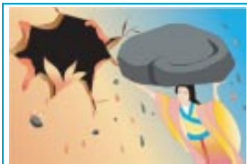
She raised a giant rock above her head and made a flying jump toward the hole

However, the prosperity did not last long. One day a great storm came. The wind rose and clouds scudded across the sky. Thunder roared, as a jagged flash of lightning set the woods on fire. Birds and beasts fled in panic at the deafening sound, but then half the sky fell off. A torrential downpour doused the fire and drenched the woods and fields. The riverbed of heaven was broken. The water in the heavenly river poured straight down. The ground was about to be submerged in a flood. Seeing that the people would drown, Nuwa's heart broke. She raised a giant rock above her head and made a flying jump toward the hole that the heaven river gushed through. But the stream was so strong that Nuwa was flushed down with the rock. She raised the giant rock and jumped again, but the water again flushed the rock and Nuwa away from the hole. Nuwa was not discouraged. She picked up many beautiful stones from the rivers and lakes, and piled them up to form a beautiful shiny five-color mountain. Next she cut reeds from the field and mixed them together with the stones, and then set fire to the reeds. The fire burned continuously for nine days and